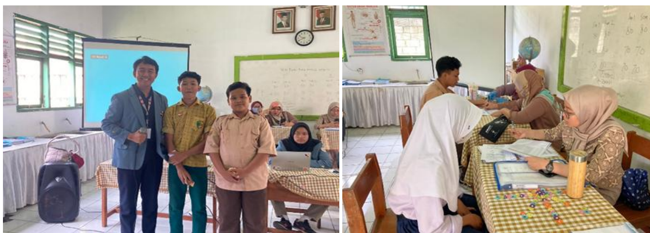
Figure 3. Outreach Session at SMP Taruna Mandiri

understanding of anemia results in insufficient iron intake among students, which in turn increases their risk of developing anemia; this highlights the importance of outreach on TTD consumption, especially for adolescent girls (Julaecha, 2020). Following the outreach session on stunting, anemia, and TTD consumption, a quiz session was conducted with the students to assess their understanding of the topics discussed. Additionally, a discussion session was conducted by posing questions for the students to respond to and discuss together, allowing them to comprehend better and review the provided material. Based on the quiz and discussion sessions, the students at SMP Taruna Mandiri were able to answer correctly and in line with the information previously presented ( Figure 3 ).