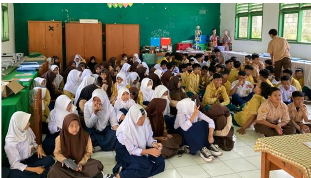
Figure 2. Outreach Session at SMP Taruna Mandiri

After identifying the students' level of routine TTD consumption and their environmental conditions, an outreach session on iron supplementation ( Tablet Tambah Darah , TTD) and stunting was conducted ( Figure 2 ). Another finding revealed that most of the students did not yet know what stunting is, nor its definition. Therefore, it can be seen that several factors could potentially contribute to stunting in their future children due to the lack of a supportive environment and insufficient provision of education and outreach, resulting in low awareness of the dangers of stunting. The students' limited understanding of stunting is an issue that must be addressed, as many of them are unaware of the basic steps to maintain their health and prevent anemia and stunting, such as managing their diet, getting enough rest, consuming healthy drinks, and adopting other related habits. The students were given basic material about stunting and its prevention, including outreach on the importance of routinely consuming TTD.