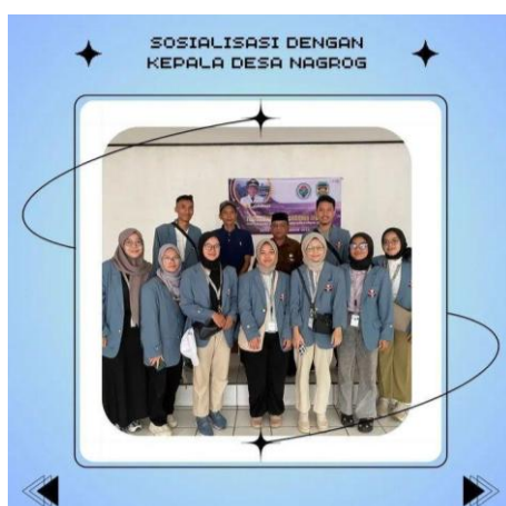
Figure 1. Socialization with the head of Nagrog village

At the beginning of the community service in Desa Nagrog, the KKN UPI 2023 team conducted a socialization session with the village head to identify the existing problems in the village. This was done to determine a program that suited the village's needs in order to find the right solutions during the implementation of the service. In addition, the KKN UPI 2023 team also conducted direct observation of the village environment to identify factors contributing to the ineffectiveness of village programs, one of which was the program aimed at maintaining environmental cleanliness, namely Jumat Nagrog Bersih (JUNARSIH) .