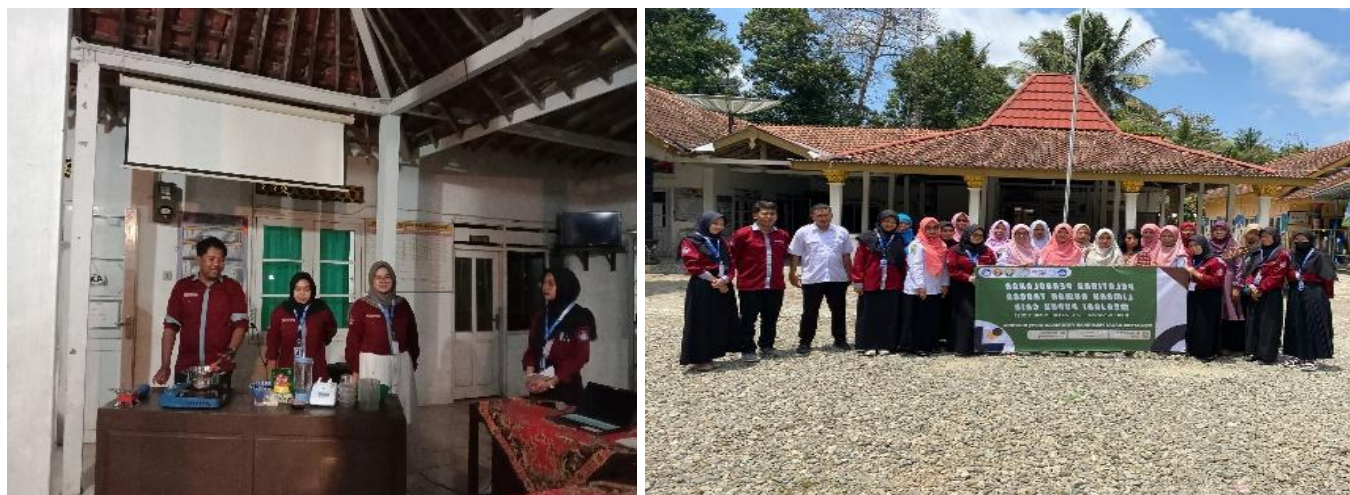
Figure 3. Training Activities

As a follow-up to the Roselle product processing training, our team conducted the final training session in the form of digital marketing training. This training aimed to provide the conservation group, especially the youth from Karang Taruna, with an understanding of how to market their products on a large scale. Held on Tuesday, October 10, 2023, with the presence of a digital marketing expert, the digital marketing training activity was successfully carried out.