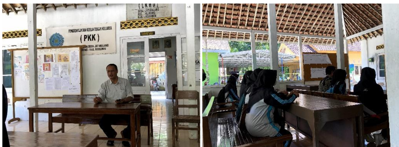
Figure 2. Initial Observation

This initial observation activity was conducted on March 3, 2023, and was attended by the Head of Jatimalang Village along with representatives from the PPK and Karang Taruna . The purpose of this initial observation was to align the community's needs with our program. The observation activities were conducted in two locations: the Jatimalang Village Hall and a traditional herbal drink seller's establishment. The results of the observation showed that Jatimalang Village has two traditional herbal drink sellers. They still need to purchase raw materials for making herbal drinks from outside the village. In the 2010s, the people of Jatimalang Village cultivated roselle plants on a large scale. The observation results led to an agreement between the PPK LSP PGSD Kebumen team and the Jatimalang Village authorities to collaborate in implementing the community service program.