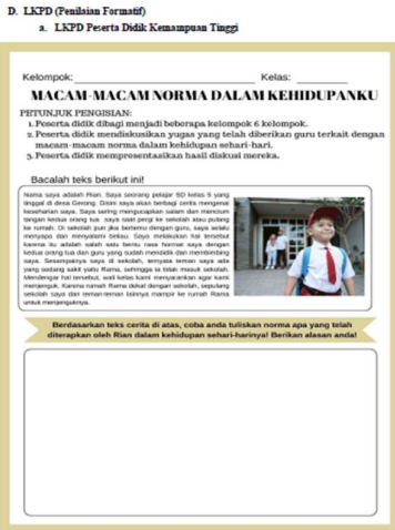
Figure 4. Student Worksheet (LKPD)