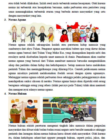
Figure 6. UbD-Based Teaching Materials